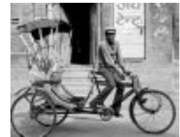
See p 391